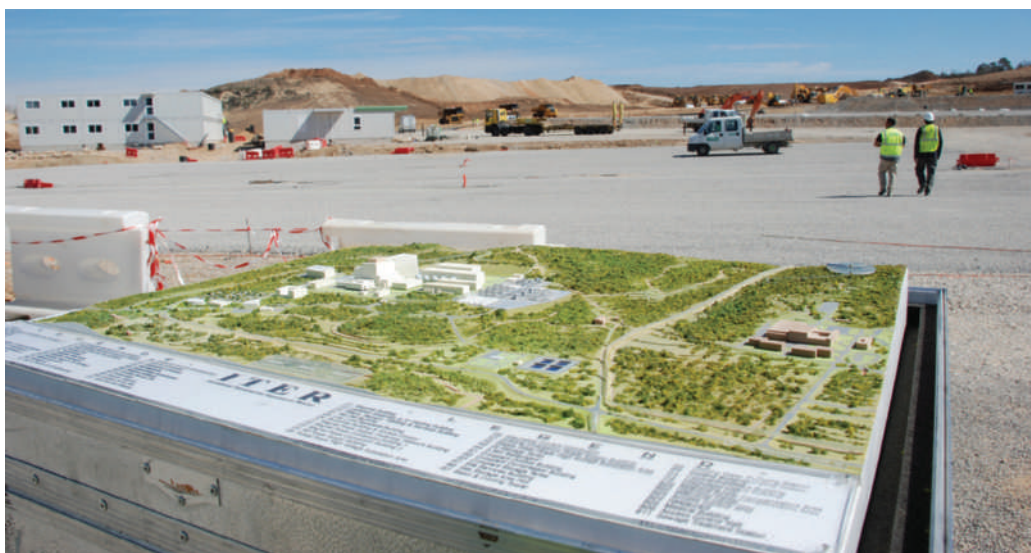
A 180-hectare stretch of land has already been cleared for ITER.

Fusion researchers say that Scenario 1 is